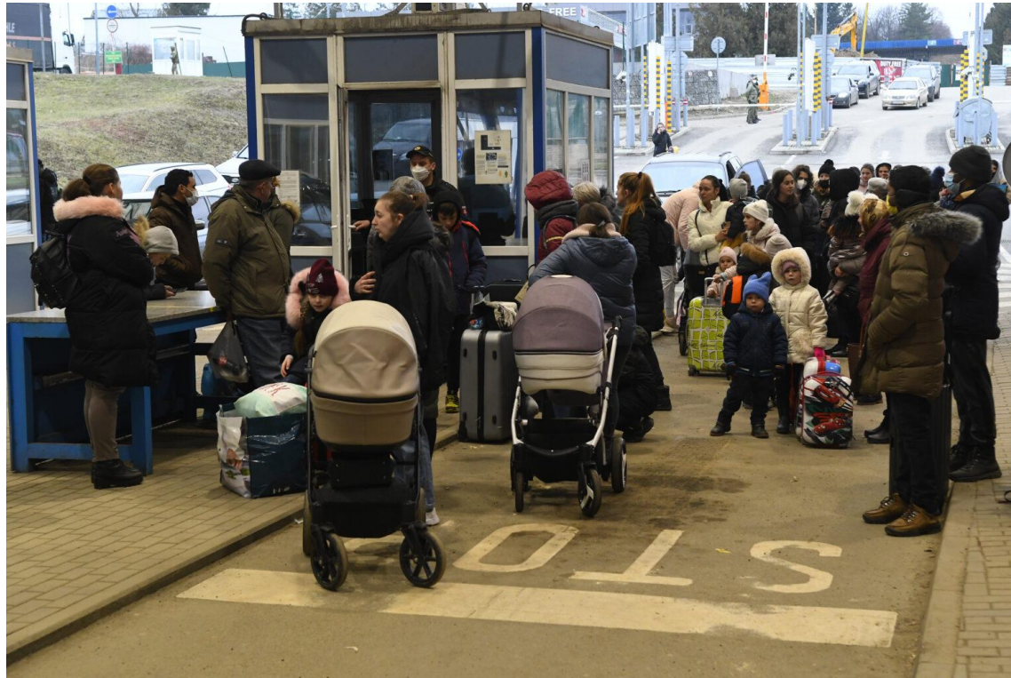
Border crossing V. Nemecké (Slovakia), 25.2.2022.